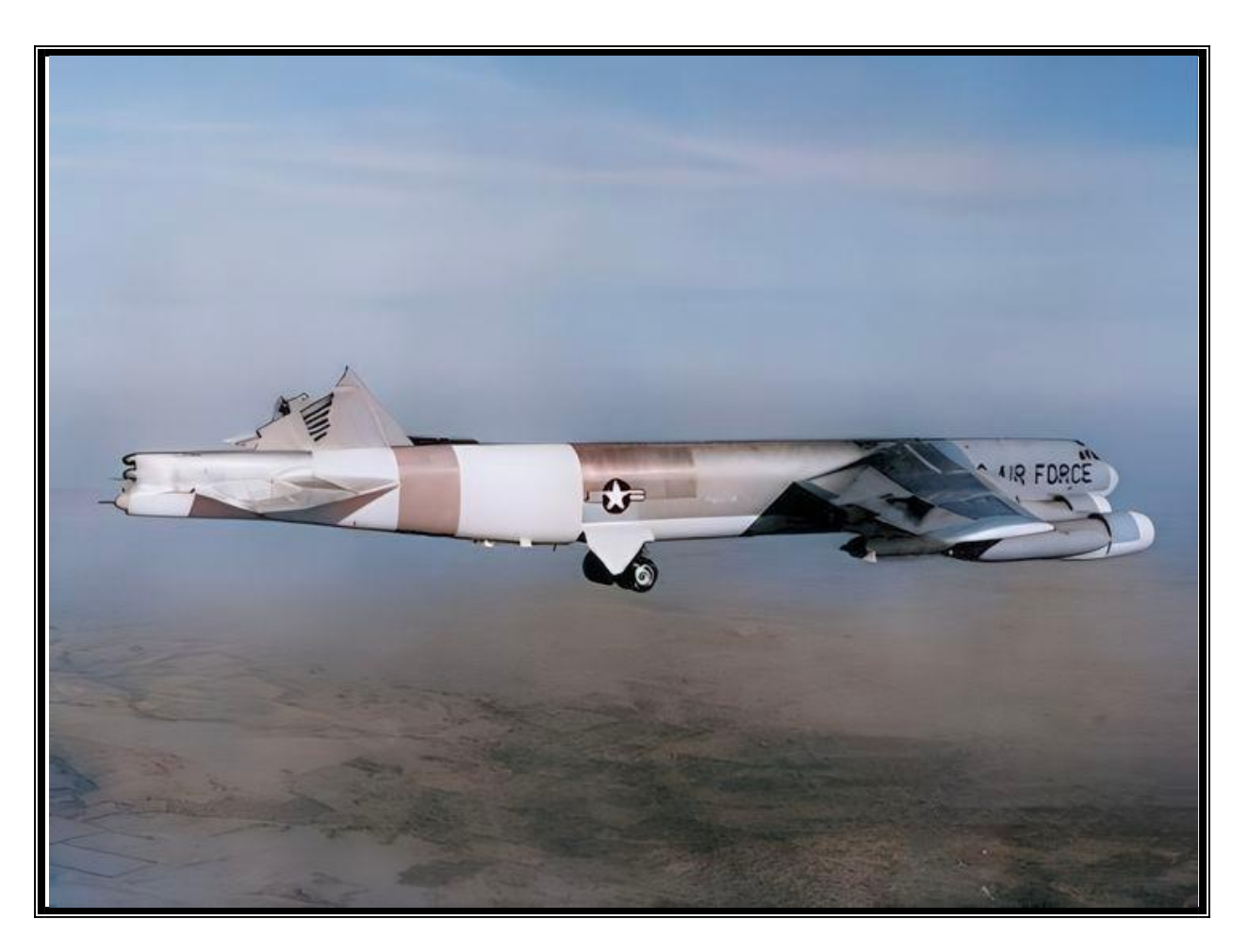
A Boeing B-52H Stratofortress (61-023) flying with its vertical stabilizer sheared off. The aircraft was being used as a test bed to identify structural weaknesses in the airframe when the event occurred. The crew, with the assistance of Boeing engineers on the ground, was able to land the aircraft safely. January 10 1964